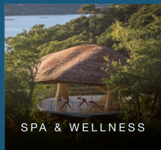
SPA & WELLNESS