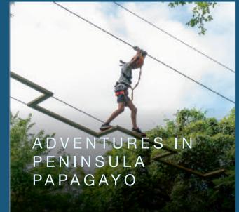
ADVENTURES IN PENINSULA PAPAGAYO