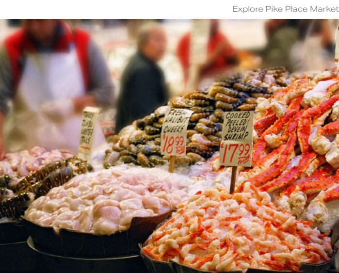
Explore Pike Place Market

Browse local museums, delve into the city's food and coffee scene, spend time on the water, or find out how Boeing airplanes are made on a factory tour—however you want to discover Seattle, we can design a unique itinerary with sightseeing options just for you.