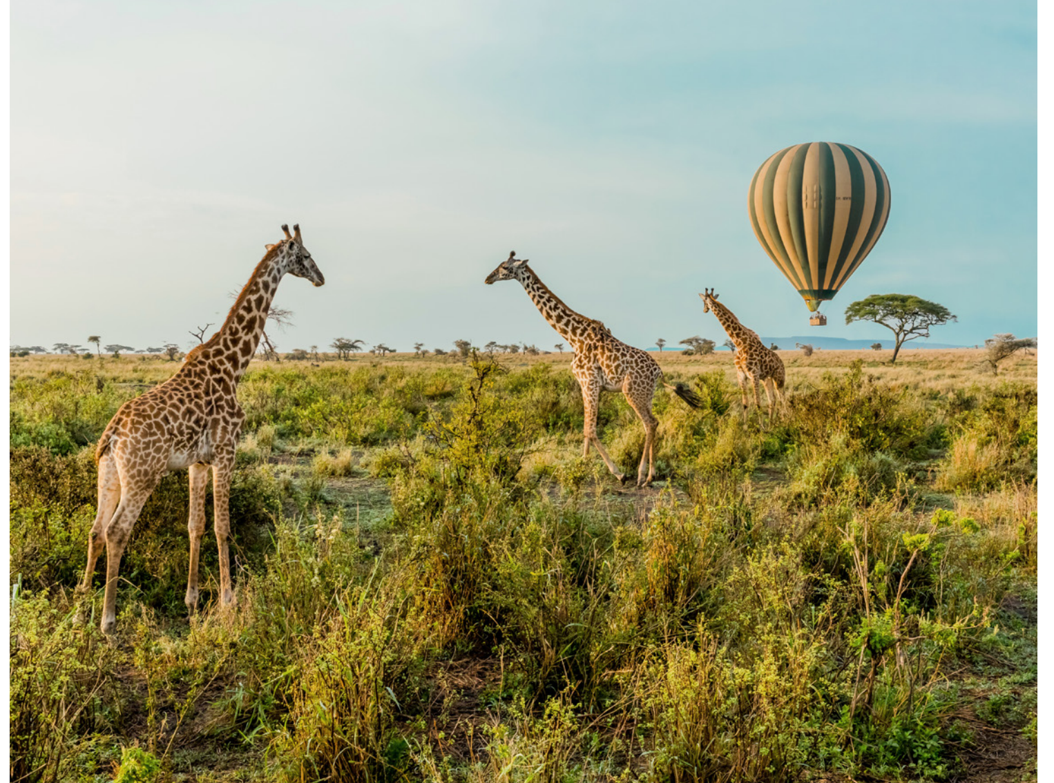
Hot-air balloon ride

Your journey through the world's most pristine landscapes continues in Serengeti National Park, where you are surrounded by the beauty of the land and its wild inhabitants. Your safari begins the moment you arrive, with a game drive to our lodge. Over the next three nights, choose from half-day or all-day game drives that bring you up close to Africa's largest and most diverse concentration of wildlife.