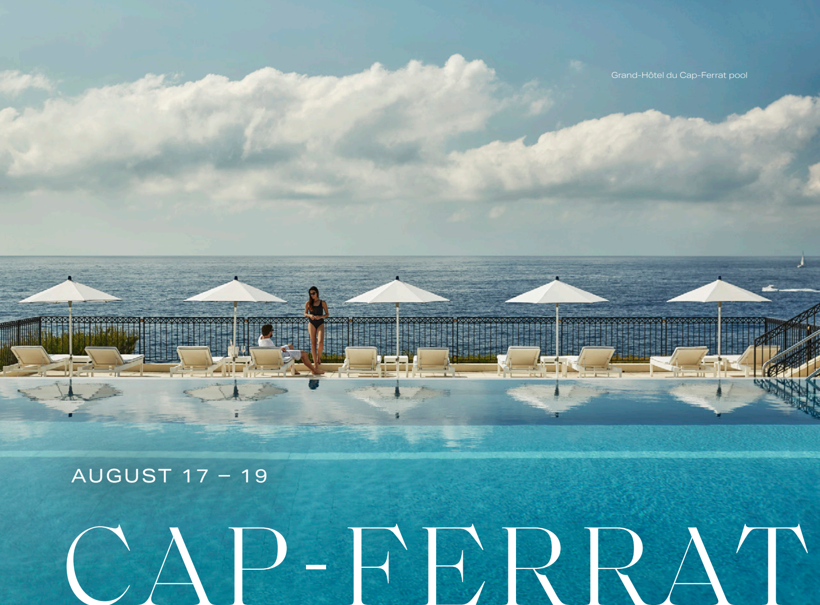
Grand-Hôtel du Cap-Ferrat pool