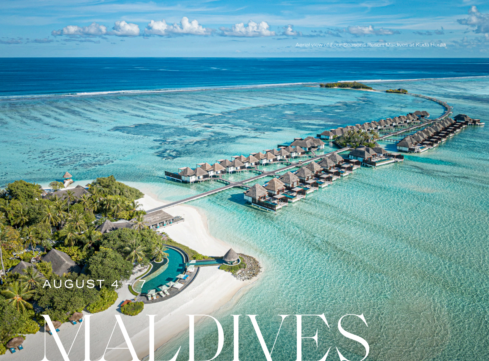
Aerial view of Four Seasons Resort Maldives at Kuda Huraa