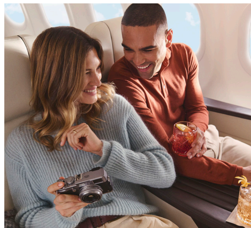
Enjoying in-flight cocktails

With the widest and tallest cabin in its class, the fully customised Four Seasons Airbus A321 offers more room to socialise, dine and relax at your leisure. The lounge area offers dedicated space to move freely about the cabin and strike up conversation with other guests. Here you will also enjoy opportunities to sample a rotating selection of food and beverages inspired by your next destination.