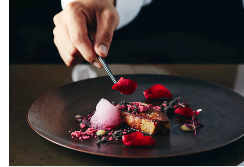
Exquisite dining experiences