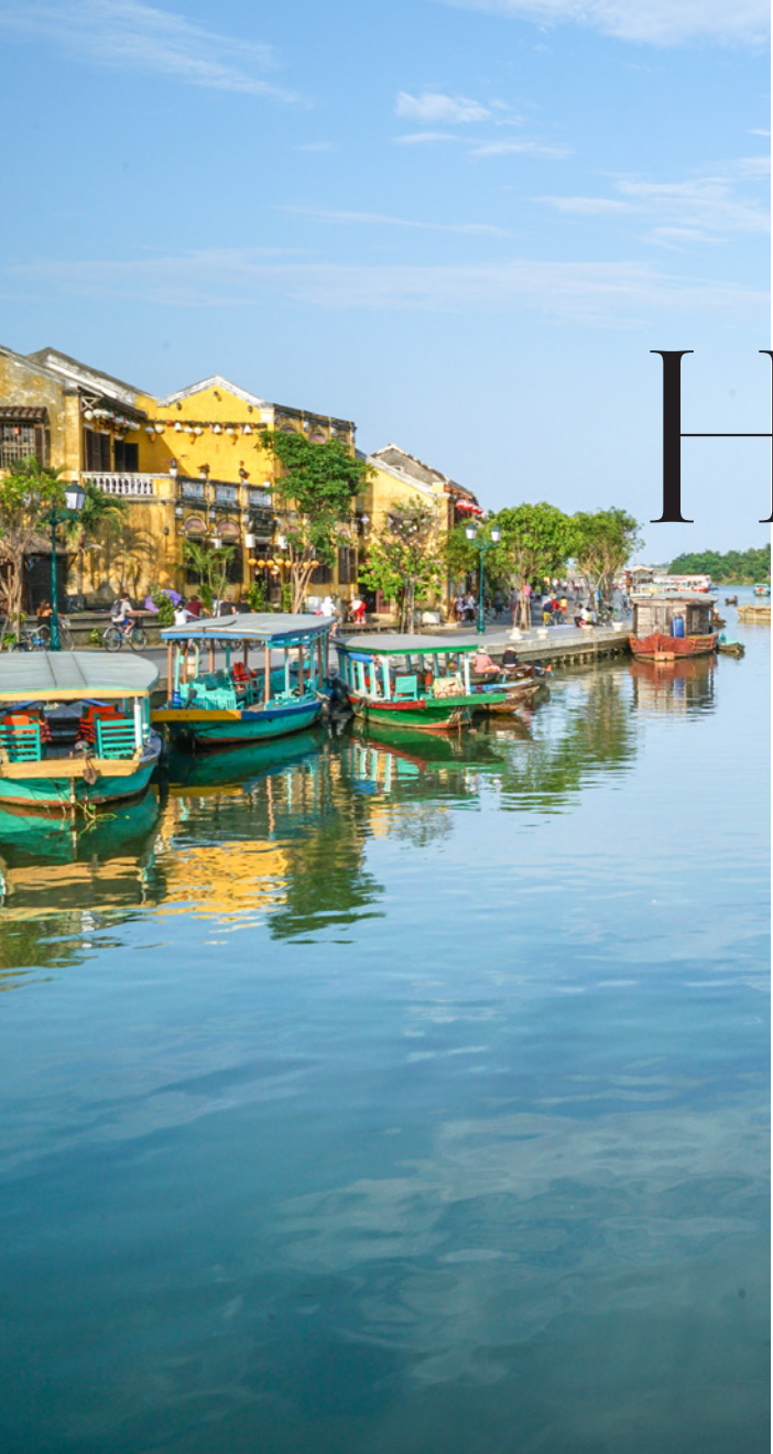
Thu Bon River, Old Town