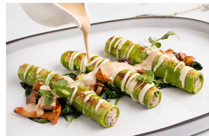
Gourmet in-flight meals

Experience the highest Four Seasons restaurant in the world. During flight, our Executive Chef will create inspiring meals that introduce you to new flavours and intriguing culinary perspectives.