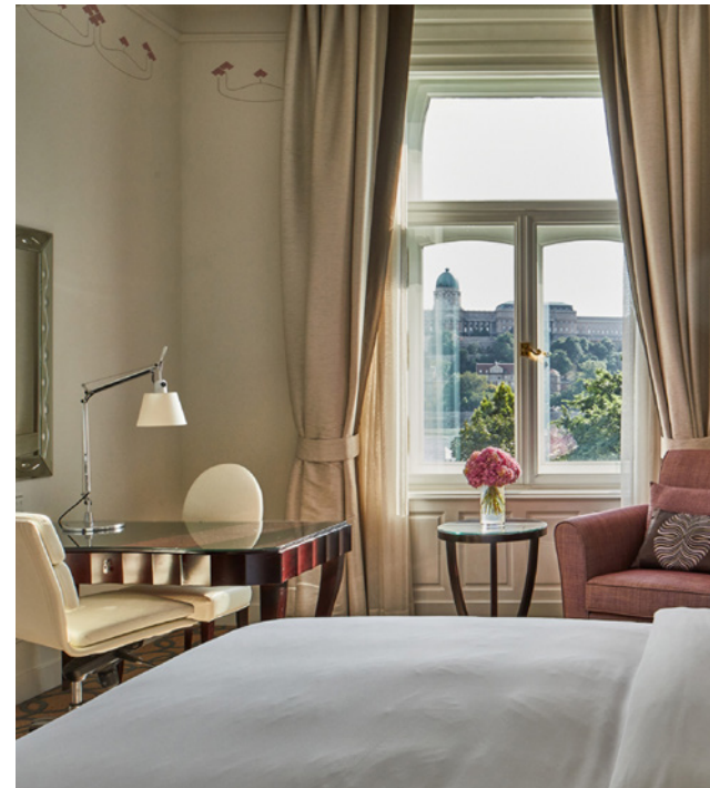
Four Seasons Hotel Gresham Palace Budapest