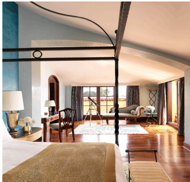
Four Seasons Hotel Istanbul at Sultanahmet

One of the world's most legendary cities, Istanbul is a millennia-old link between East and West. Encounter the architecture of empires past in a dazzling cityscape where soaring Byzantine churches stand alongside Ottoman mosques and Roman ruins.