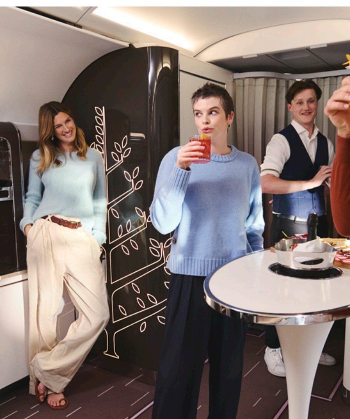
Savour snacks and beverages in the Lounge in the Sky