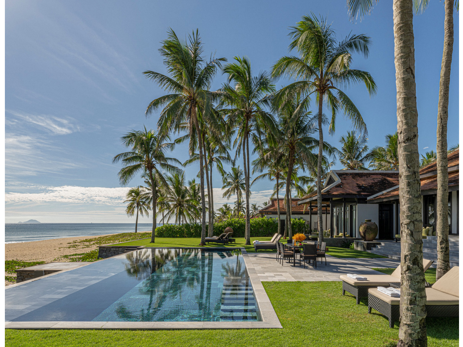
Four Seasons Resort The Nam Hai, Hoi An

Set on a private half-mile stretch of pristine beach, Four Seasons Resort The Nam Hai, Hoi An has long been regarded as Vietnam’s premier beachfront resort. Three pools cascade to the shoreline, and refreshed villas feature outdoor rain showers overlooking the lush gardens. Calm your body and mind at the Heart of the Earth Spa, a haven for restoring harmony.