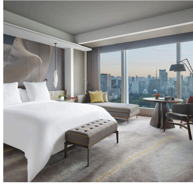
Sweeping city views from the room

Your adventure begins in Japan's eclectic metropolitan capital, a city of contrasts where ancient temples and age-old markets stand alongside modern high-rises and a sparkling skyline.