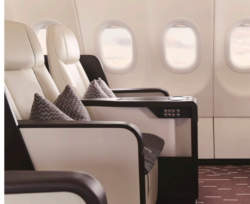
Italian-leather flatbed seats