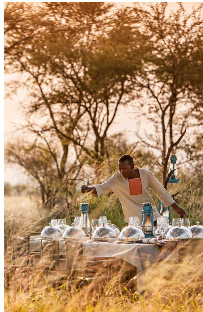
Bush dinner at Four Seasons Safari Lodge Serengeti

Our global network allows us to open doors to unique experiences, providing exclusive access in each destination. Our local experts and on-the-ground guides are ready to share their insider knowledge, and property concierges have recommendations to help you explore according to your personal travel style. Along the way, our journey team guides you seamlessly between your chosen activities, ensuring that all you need to do is enjoy the experiences in store.