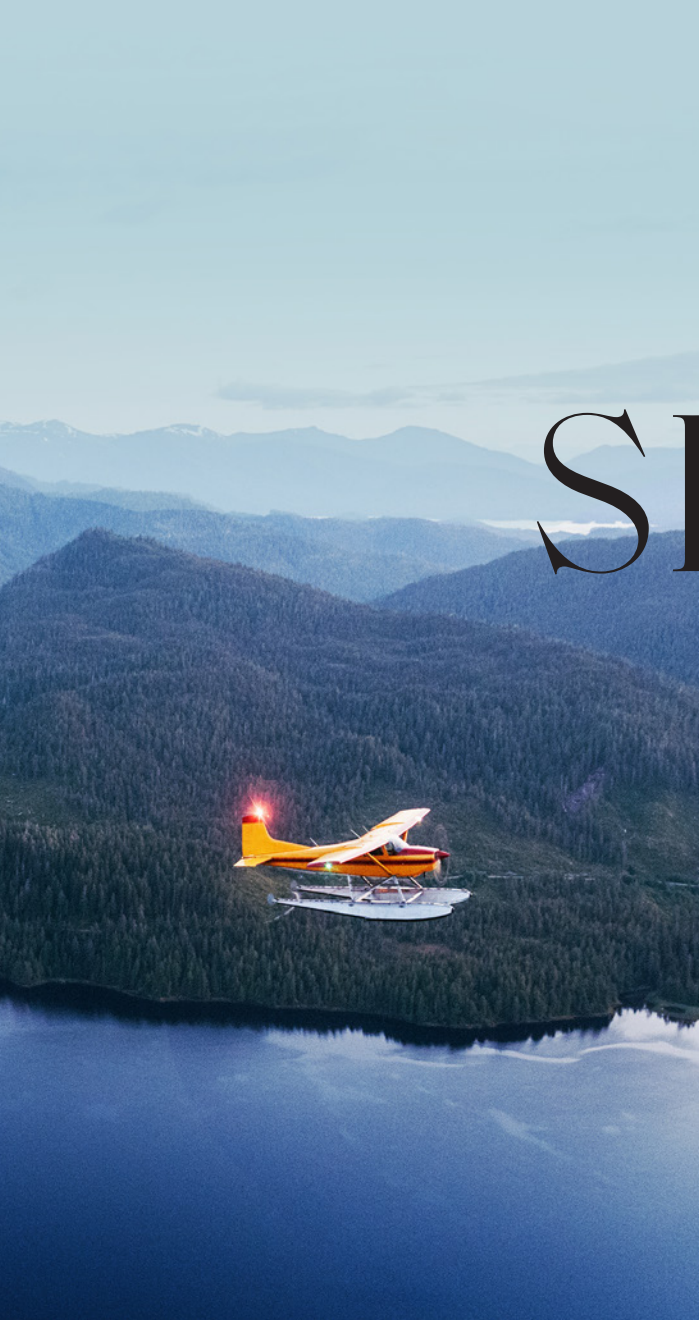
Seaplane tour of Seattle and Puget Sound