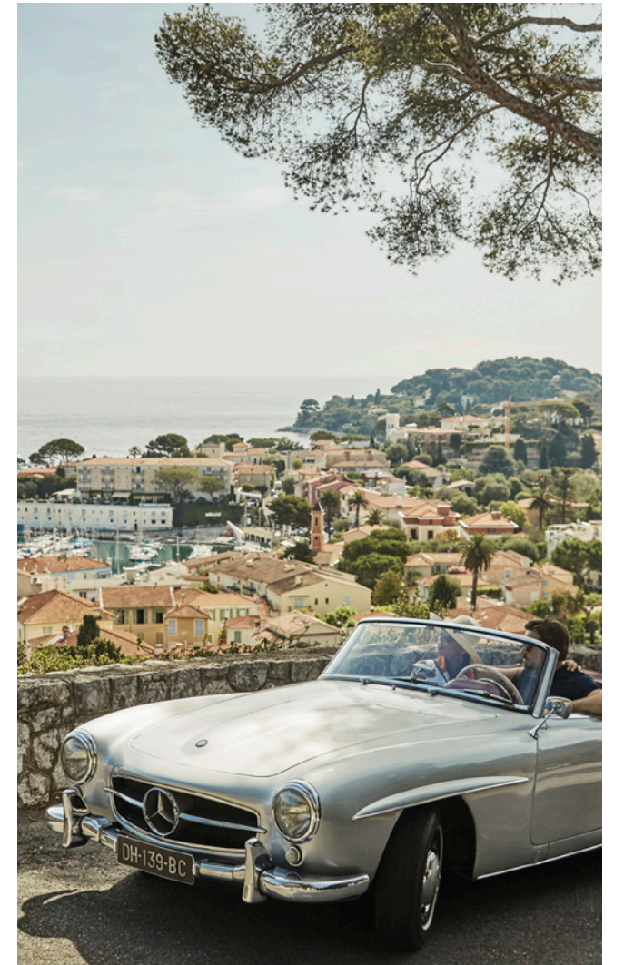
Vintage car ride to Monte-Carlo

Farewell doesn't have to mean goodbye—at least not yet. Opt to extend your journey to spend some time exploring the best of the French Riviera before embarking on your flight home.