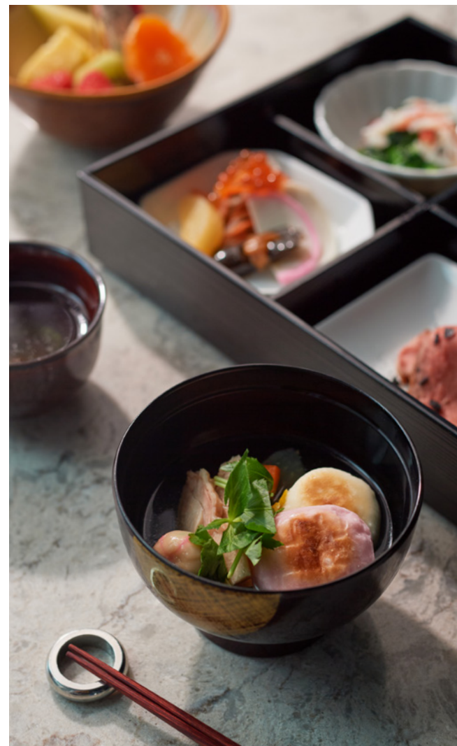
Culinary delights abound.

Visit Tokyo's famed Tsukiji outer market with a Michelin-distinguished chef to source fresh, seasonal ingredients for a cooking class. Learn the secrets of preparing and presenting different Japanese dishes under the guidance of your chef, enjoying the fruits of your labour and a sake tasting.