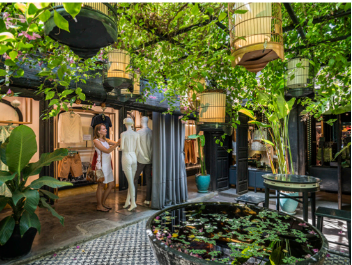
Visiting a local tailor

Meet with the most prestigious tailor in Hoi An for a consultation—your customised outfit will be delivered to our hotel before we depart Vietnam.