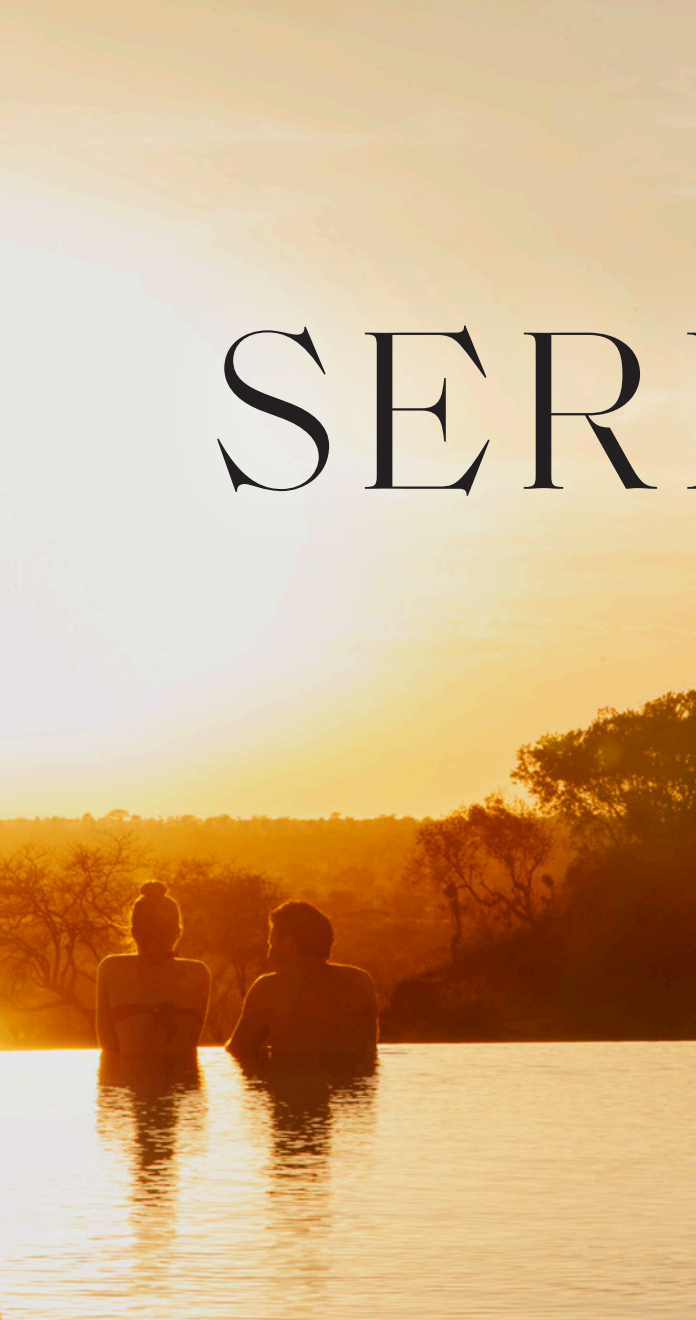
Infinity pool overlooking an elephant watering hole