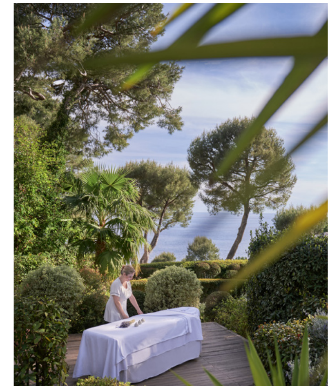
Outdoor spa service, Grand-Hôtel du Cap-Ferrat

Immerse yourself in culinary mastery with a curated mix of dining experiences from special-event group dinners with your fellow travellers to opportunities to dine at local restaurants on your own. Our Onboard Concierge is always on hand to personalise each experience for you, whether providing restaurant recommendations, making dinner reservations, or ensuring your morning coffee is prepared just the way you like it.