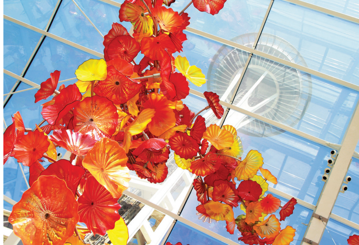
View of the Space Needle from Chihuly Garden and Glass