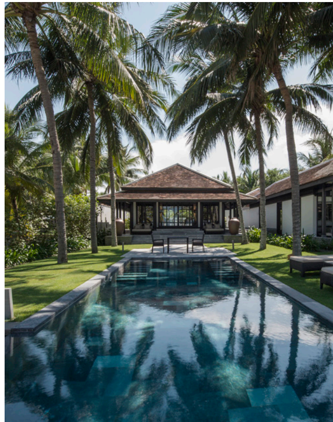
Plunge pool, Four Seasons Resort Maldives at Kuda Huraa

Savour each moment while we handle the rest. The Four Seasons Private Jet Experience offers you the chance to discover a stunning range of destinations with the comfort of Four Seasons service every step of the way. Our team of dedicated professionals includes an Onboard Concierge, Executive Chef and flight crew equipped with proprietary Four Seasons service training, as well as a trip physician who attends to any health needs you may have. We'll see to it that all the details and logistics of your journey are taken care of, allowing you to focus on the joys of an adventure that you could only get with Four Seasons.