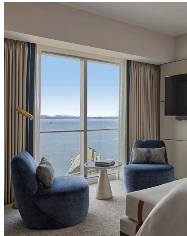
Dramatic Elliott Bay views from Four Seasons Hotel Seattle