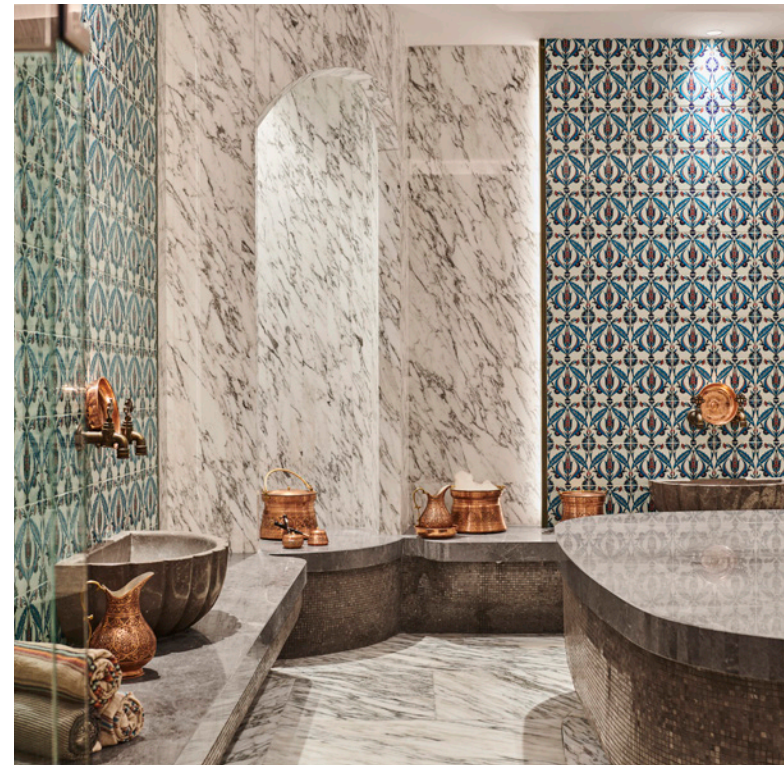
Four Seasons Hotel hammam

Witness the legacy of civilisations as you marvel at the opulence of the Topkapi Palace, admire the magnificently tiled Blue Mosque and gaze up into the hallowed dome of Hagia Sophia, a treasure of Byzantine and Ottoman architecture.