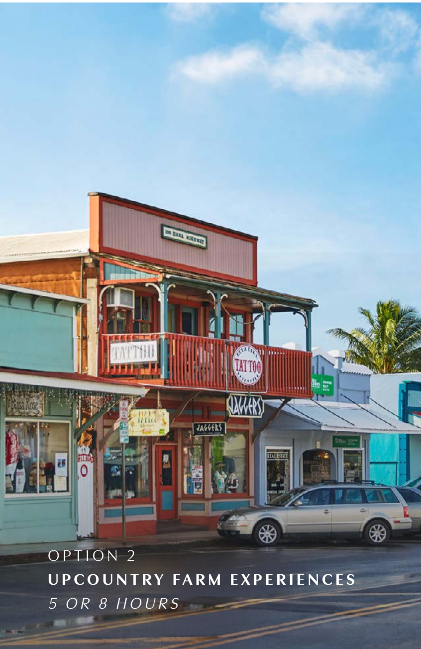
OPTION 2 UPCOUNTRY FARM EXPERIENCES 5 OR 8 HOURS

Head inland to higher elevations, where rich volcanic soil nourishes the lush upland farms. Visit a working pineapple farm, or extend your experience with a tour of a working goat farm and a tasting at an organic vodka distillery.