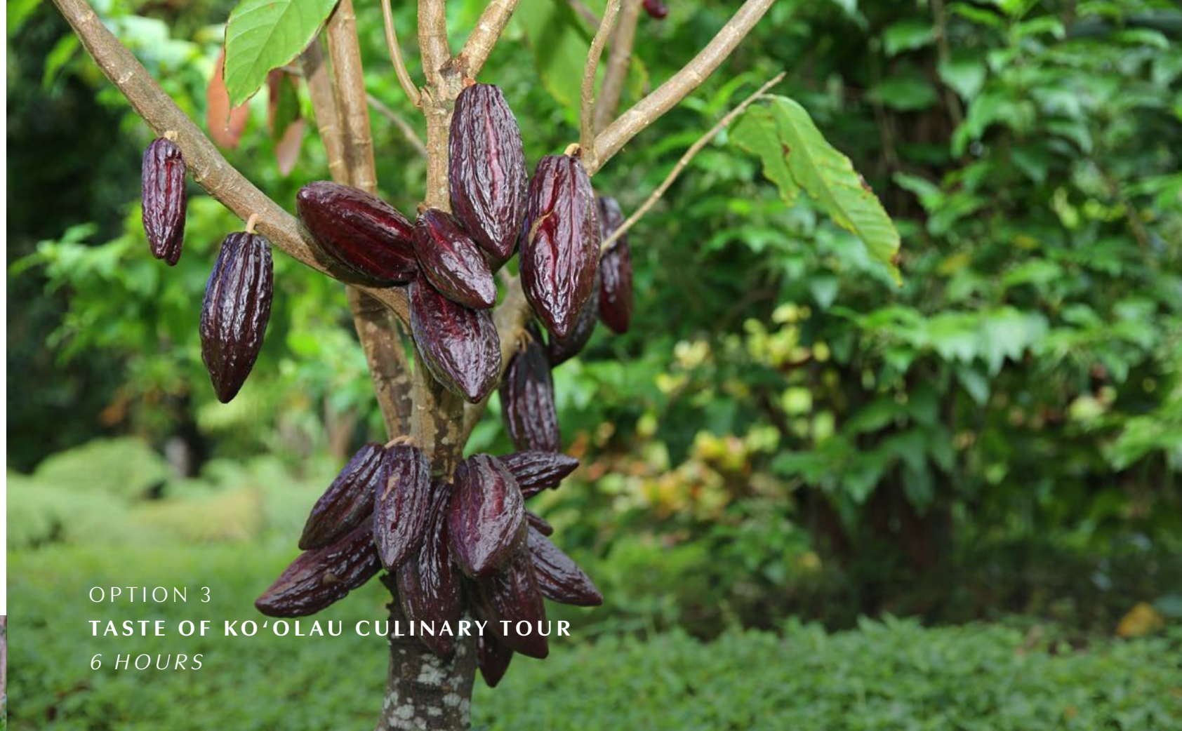
OPTION 3 TASTE OF KO'OLAU CULINARY TOUR 6 HOURS

Explore the delicious flavors of O'ahu as you take a scenic drive through the Ko'olau mountain range, located on the island's Windward Coast. Select from a variety of options along the way, giving you hands-on experiences and personal connections to local food producers.