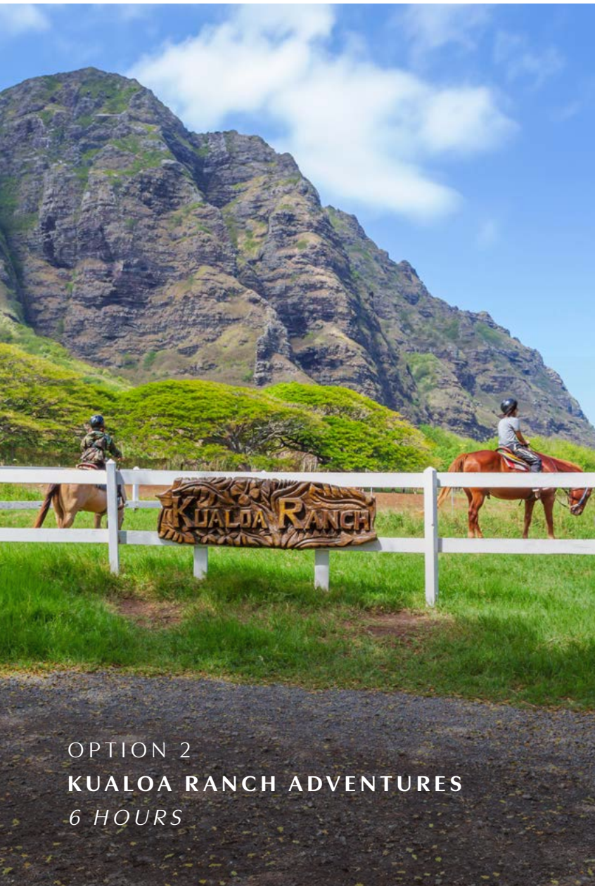
OPTION 2 KUALOA RANCH ADVENTURES 6 HOURS

This private nature reserve is a 4,000-acre (1,620-hectare) paradise, offering numerous outdoor activities exploring the vast valley that was the filming location for Jurassic Park and many other movies and TV shows. Select from a variety of ways to explore this magnificent landscape.