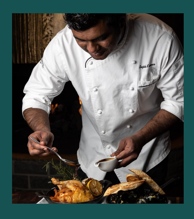
AVAILABLE FROM 5PM TO 9 PM* Please allow 1 weeks' notice for this experience. A minimum of CAD 300 per person (plus chef service charge) applies. Limit of 8 guests per chef.